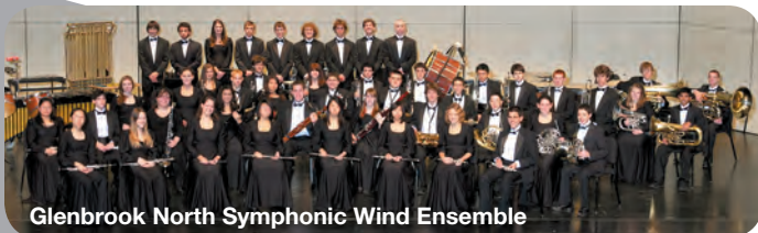
Glenbrook North Symphonic Wind Ensemble