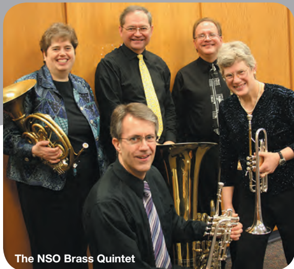
The NSO Brass Quintet

With the Glenbrook North Symphonic Wind Ensemble